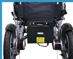
Motor 1 Motor 2 500W dual motor, DC motor /strong climbing ability