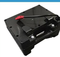
Carbonic acid battery Driving distance is about 12km