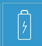
High battery life