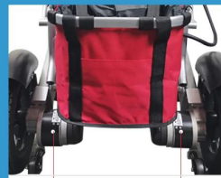
Motor 1 500W dual motor, DC motor /strong climbing ability