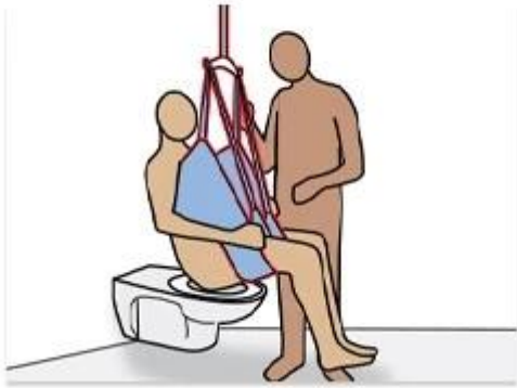
Lifting from floor Toileting/Bathing