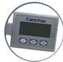
Optional Weight Scale