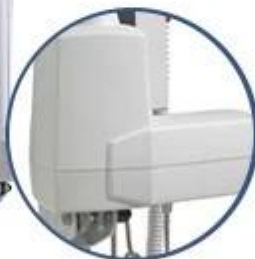
Battery Control Box