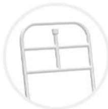
Sturdy steel frame