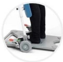
Weight capacity 150kg