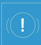
EABS Brake system