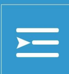
Easy to fold