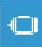
500W dual motor