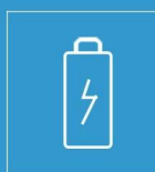
High battery life