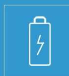
High battery life