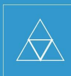
Carbon steel material