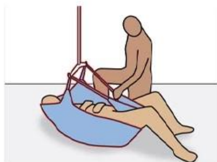
Lifting from floor

Now our products conform to ISO9001, ISO13485, ISO10535, CE, SGS, UKCA etc. standard.